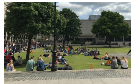
Schools and universities

EU Distribution: Paramedica Mil-Sys Sp. z o.o. Sp. k. Czerniewiecka 9/27 02-705 Warsaw, Poland