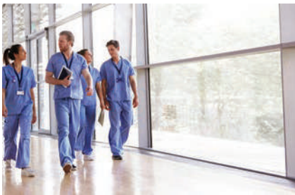
Hospitals and clinics